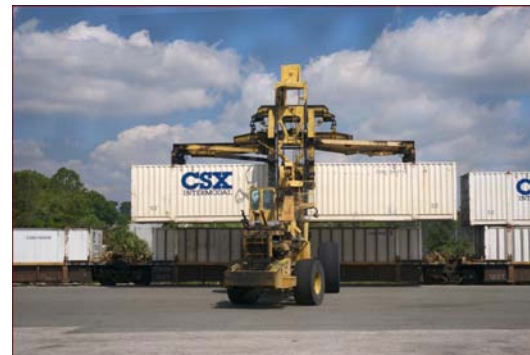
Integration and Connectivity