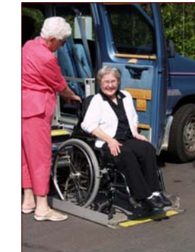
Accessibility and Mobility