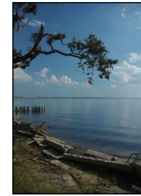
Environment/Quality of Life